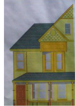
921 Carteret Avenue Trenton, NJ