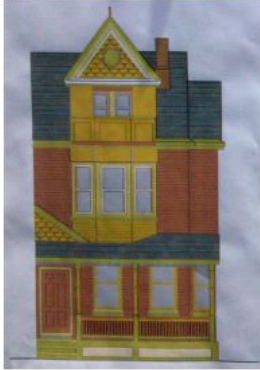
825 Carteret Avenue Trenton, NJ