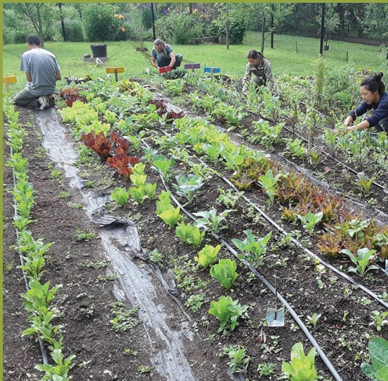
Harvesting for food donation